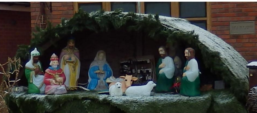
It's all in the detail.